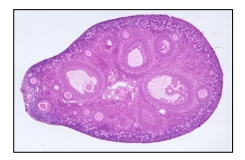
stiched together single images, producing a panorama view of the whole sample