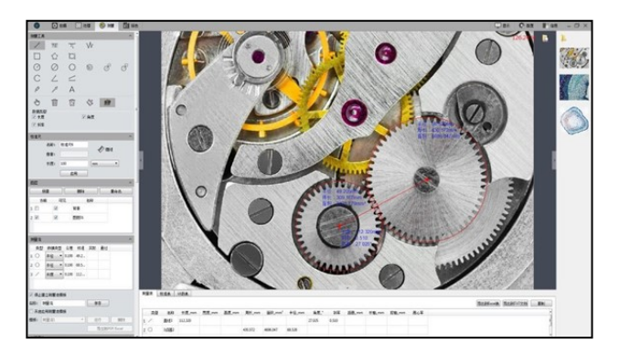
Mosaic V2.4 Software